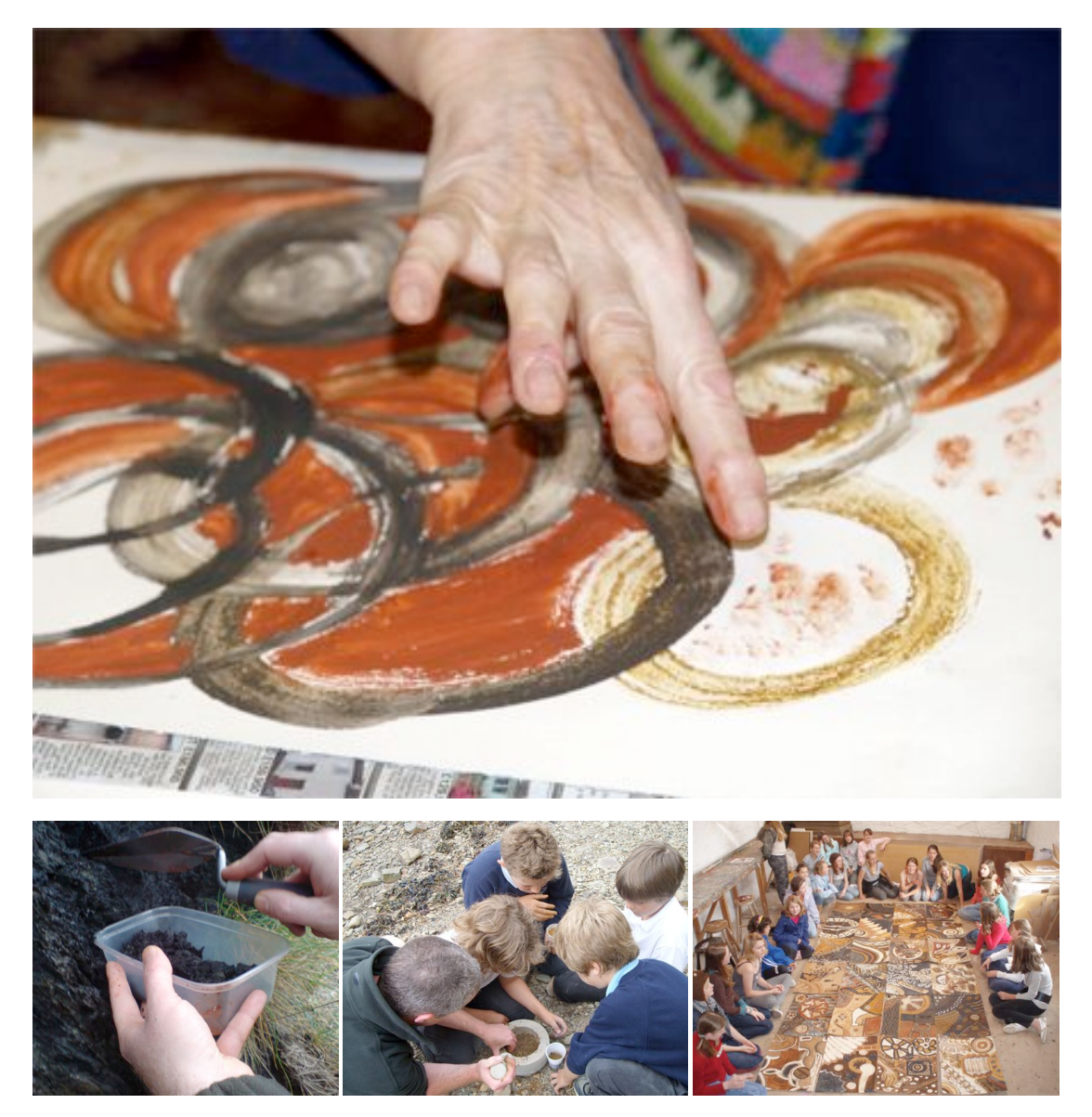
(from top and left to right: 'Playing with paint', Appledore Visual Arts Festival, 2008; 'Mining' for Bideford Black, Abbotsham; 'Making Paint' on the beach, Fremington Quay; Painting with the Earth Workshop, Beaford 2008)

By simply drying and crushing the raw materials we have a starting point for making paint. The powders produced may be mixed with water, linseed oil, PVA, egg yolk or other commercially available mediums to produce paint. Some of the more clay-like materials may be moulded into pastels, others drawn with directly. Through experimentation we may find out which raw materials work best to produce a desired paint or effect. We can spend time examining their consistency, their lustre and graininess and their behaviour on different surfaces. The phenomenal age of the pigments can only be proof of their permanence and light fastness. But please remember when collecting pigments to always think about the amount of raw material that is available to use and the visible and structural damage that may occur due to your 'mining' activities.