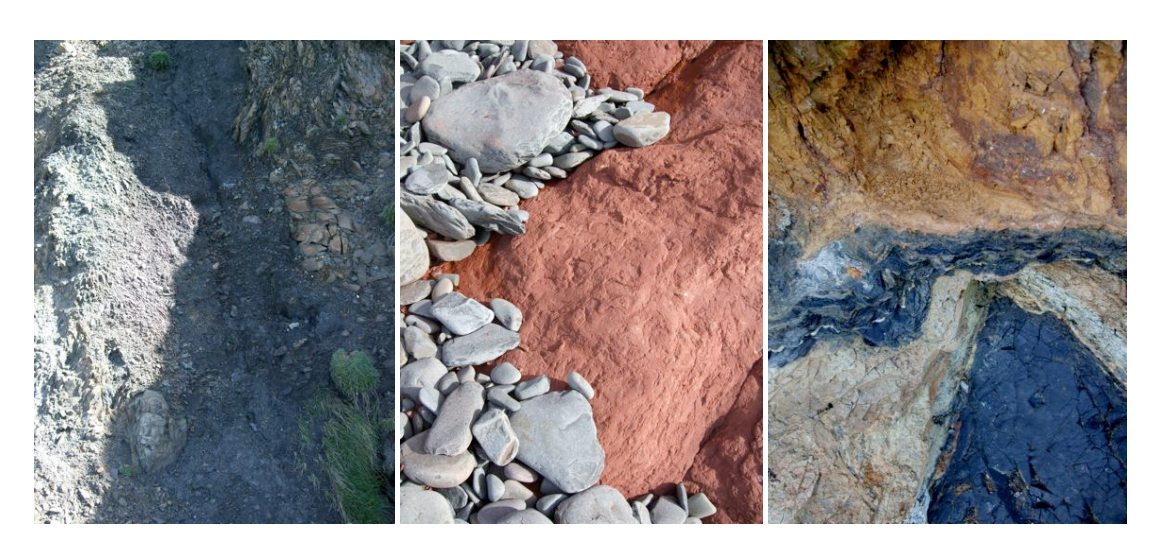
(I-r: BIDEFORD BLACK, Abbotsham; PEPPERCOMBE CLIFFS; FREMINGTON QUAY)