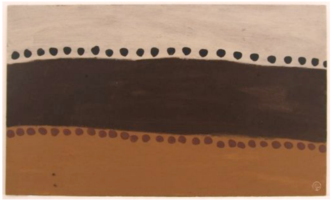
river (earth pigments + pva on driftwood; 57x34cm; 2009)