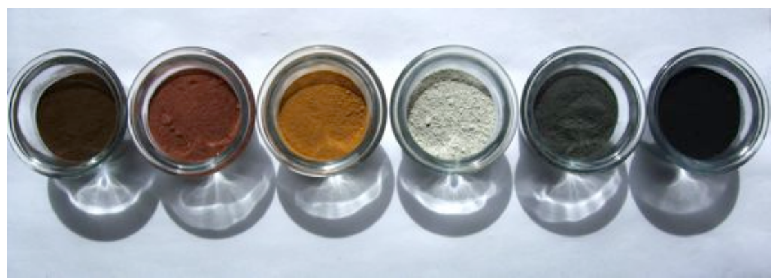
north devon landscape (ground earth pigments; peter ward 2009)